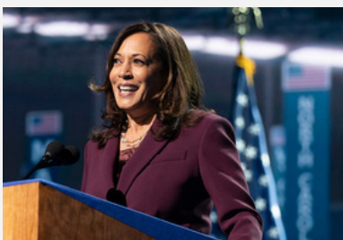
Vice President Kamala Harris, daughter of an Indian-American mother

When Joe Biden won the Presidency, his vice presidential running mate Kamala Harris made history. By winning the 2020 election, she became both the first woman and the first person of color to be elected vice president of the United States. She is the daughter of two immigrant academics: an Indian-American mother and a father from Jamaica. You can read more about her on WhiteHouse.gov .