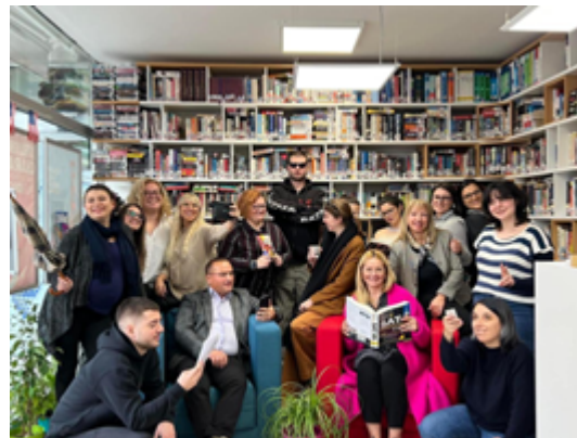
American Spaces North Macedonia team at American Corner Skopje, November 2022

North Macedonia did it first, and then Serbia soon followed; at their recent strategic planning meetings, American Spaces networks in both countries staged group photo shoots in American Corner Skopje and American Corner Belgrade , respectively, to show off the personality of each Space, as well as each country's charming and dedicated teams of American Spaces managers.