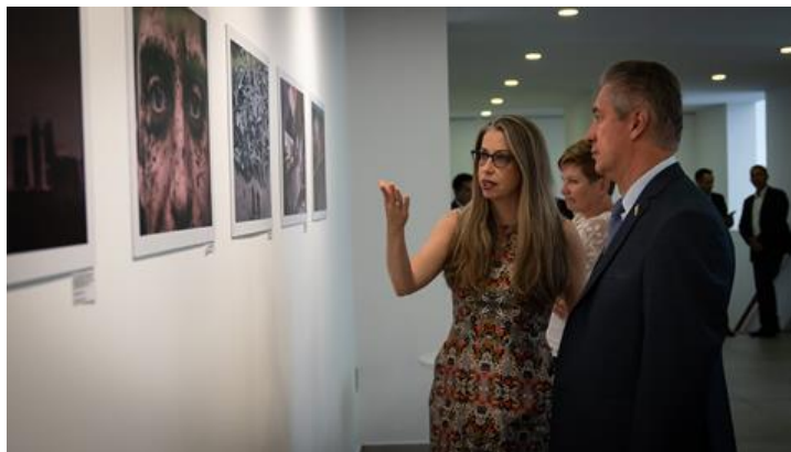
The photos above show images of the event and artwork from the BNC Santiago exhibition opening.