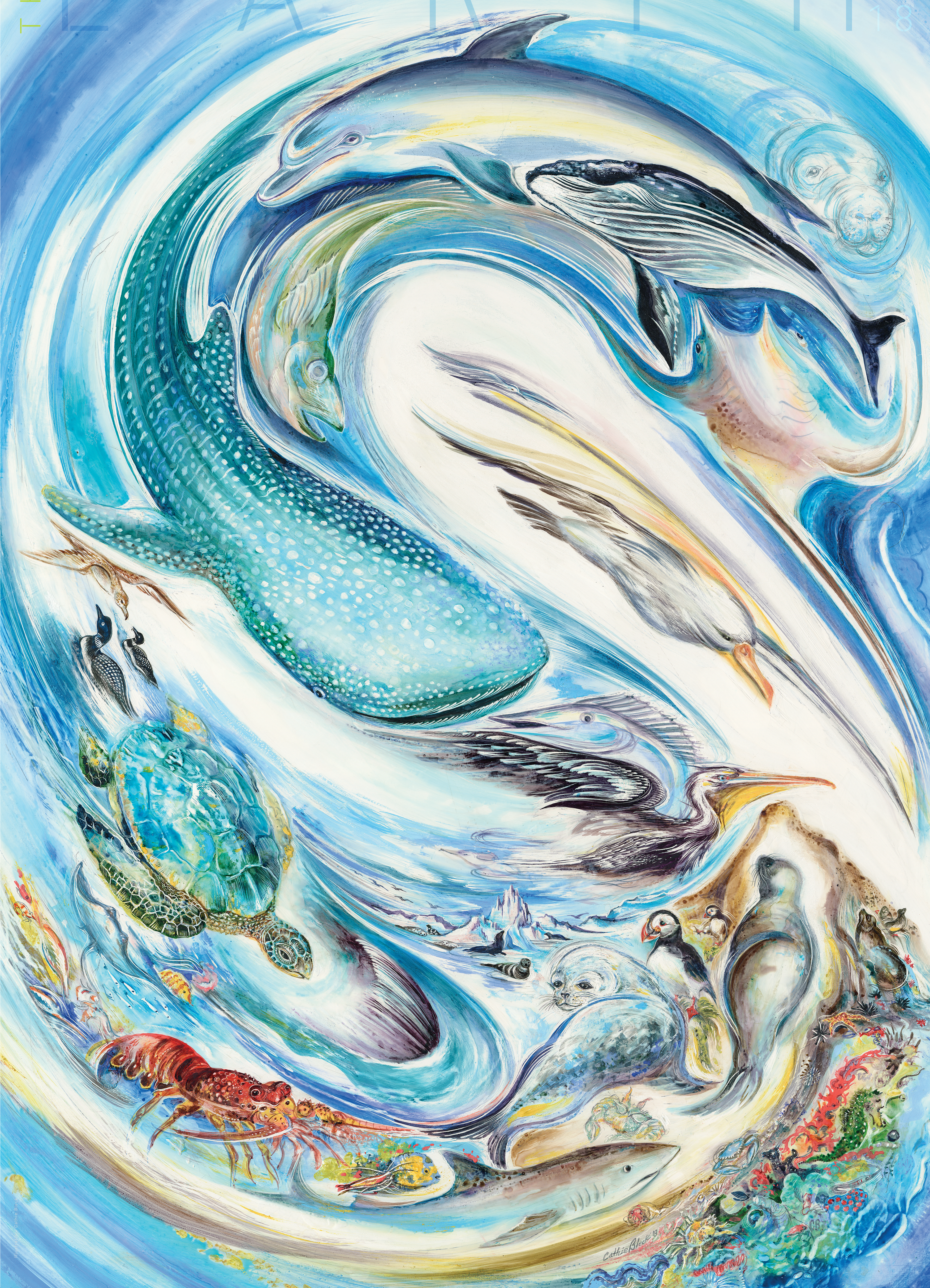
Illustration: Cathie Block