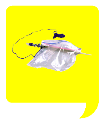
* remind the teams that the prototype isn't meant to be a perfectly rendered model, but a rough physical sample that demonstrates how the idea will function *